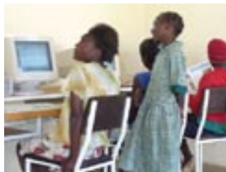
Above and top right: Children at the Home of Joy in Zambia